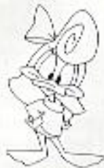
SHIRLEY THE LOON