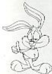
PLAYER: BUSTER BUNNY

HINT: When you reach a doorway, stand in front of it and press the CONTROL PAD up to open it.